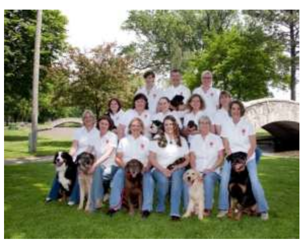
American Animal Hospital team