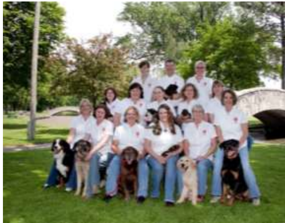
American Animal Hospital team